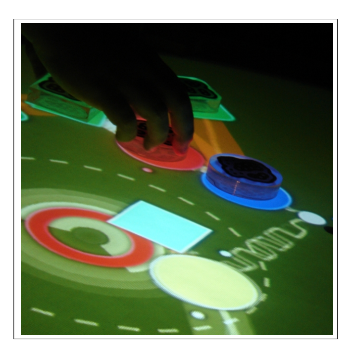
Figure 2. Local and remote synth objects

Networked reacTables interchange their objects' ID, location and orientation by transmitting UDP packages via a conventional IP network using the TUIO [11] protocol which is based on Open Sound Control (OSC) [15] messages. UDP assures the fastest transport and the lowest latency method, while TUIO provides the necessary redundancy to guarantee a stable and robust communication. Connected tables just pass on their raw control data, which they receive from the sensor component, without transmitting any audio data at all. The resolving of the synthesizer patches and the actual sound synthesis is done locally at each installation site, which reduces the impact of possible latency problems to a minimum. Each client just treats the control data from objects of a remote table the