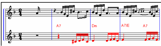
Figure 2. The first 4 bars from “Naquele Tempo” by Pixinguinha and Benedito Lacerda.

The simplified diagram shown in Figure 1 depicts too the harmonic progressions found in minor tones, and presents the most common modulating degrees. The modulation to, and the return from a key through the most common modulation path in each of the previous diagrams, can be exemplified for the C-minor scale as follows: Cm – B7 – E – A7 – Cm.